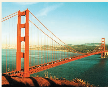
THE GOLDEN GATE BRIDGE

Since 1937 more than 1,300 persons have committed suicide on the Golden Gate Bridge that spans San Francisco Bay, in California. The Golden Gate Bridge District, after years of study and debate, has finally elaborated five potential designs for a barrier to prevent suicides. The potential environmental impact of the five