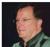
Professor Lourens Schlebusch IASP national representative for South Africa

Comparatively speaking, South Africa, which is part of the AFRO E region, appears to have higher suicide prevalence rates than many other African countries. Data from various studies provide a disturbing profile of suicidal behaviour in South Africa with rates of up to 19 per 100,000 of the population or higher